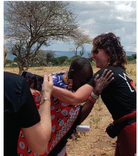
The powerful Kenyan response to Watts of Love coming to help in their community.

To learn more about WOL and their continued global impact or are interested in joining one of their global travel teams, visit www.wattsoflove.org .