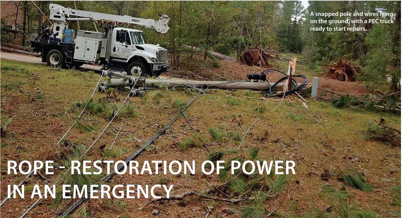
A snapped pole and wires lying on the ground, with a PEC truck ready to start repairs.