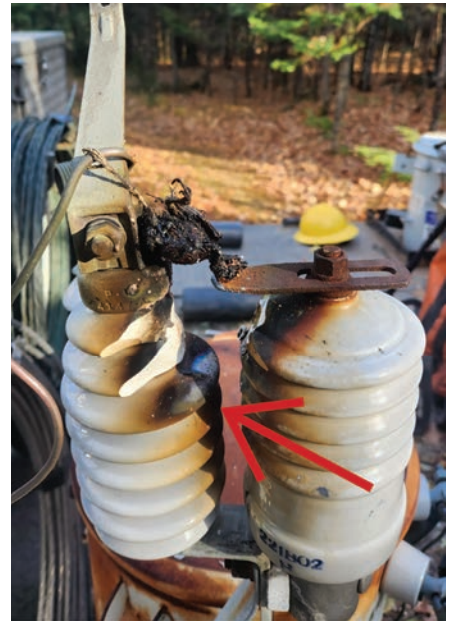
A bird caused the lightning arrestors to burn and crack (red arrow), creating a path to ground, causing an outage.

If you have concerns with persistent blinks at your home, reach out to PEC.