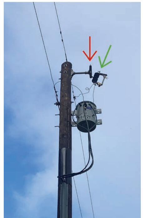
A squirrel made contact between the T bracket (red arrow), which has ground potential and cutout (green arrow), which is energized equipment, causing an outage.