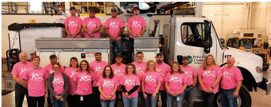
Pictured are PEC employees wearing their pink shirts in support of an important cause—breast cancer awareness.

October was an important month for PEC, as it was National Co-op Month, Cybersecurity Awareness Month, and Breast Cancer Awareness Month. The PEC staff united for a cause that touches the lives of many—Breast Cancer Awareness. Throughout October, PEC employees contributed to collectively donate funds to cancer research.