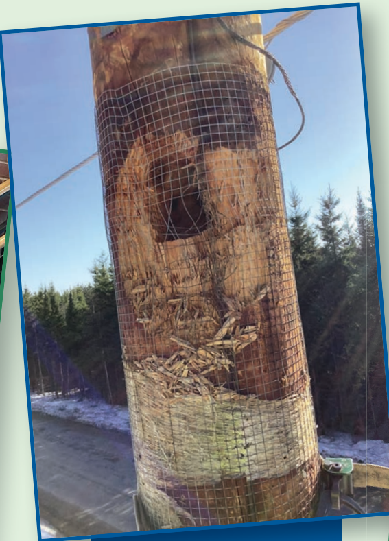
A woodpecker found this pole, which had wire animal guard on it, but it got through the guard and put a large hole in the top of the pole.