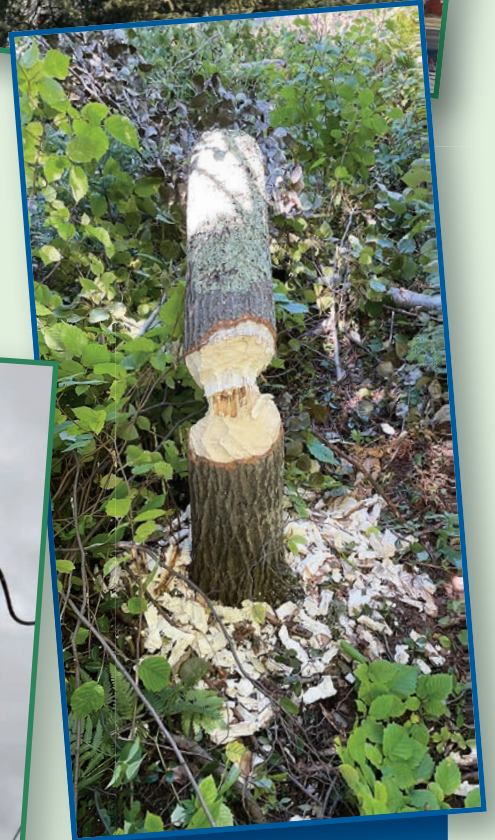
A beaver chipped away at this tree until it fell. When it did fall, it fell onto the power line, causing an outage.