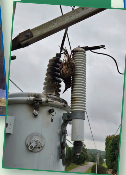
Ever wonder why the power goes out when there is no apparent cause? No snow, no rain, no wind? Pictured here is a bird that flew into the wrong spot, causing an outage of an entire substation feeder.