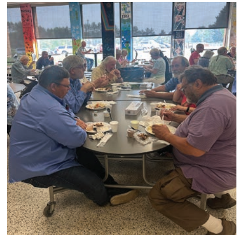
Board directors, members, and guests visited while enjoying a chicken dinner catered by Phillips Café.

The 2025 annual meeting celebrated the cooperative's accomplishments over the past year but also projected a confident future of commitment to community, energy independence, and member engagement.